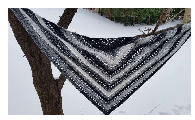
Sample 1-Lion Brand Scarfie