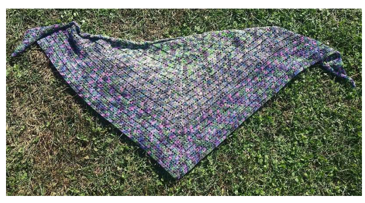
Sample 1- Madelinetosh Tosh Merino Light

specialty yarn rather than the stitch work. Sample Generally, the rule of thumb when using hand-dyed yarns is to switch skeins every row or so to keep a consistent coloring throughout. However, this sample was made using one entire skein before the other which gives it a completely different look. Gradient yarns and yarns that have long color changes would also work well in this pattern. I chose not to block it because I like how the ends curl. Overall, this a versatile pattern that can be