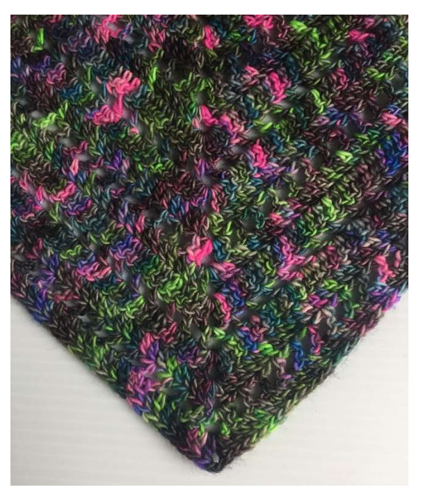
Finishing: Fasten off. Block if desired.

Rep Rows 3 to 8 until desired size is reached. It is best to finish on a "solid" row (Row 4, 5, 7, or 8) to maintain stability across the outer edges.